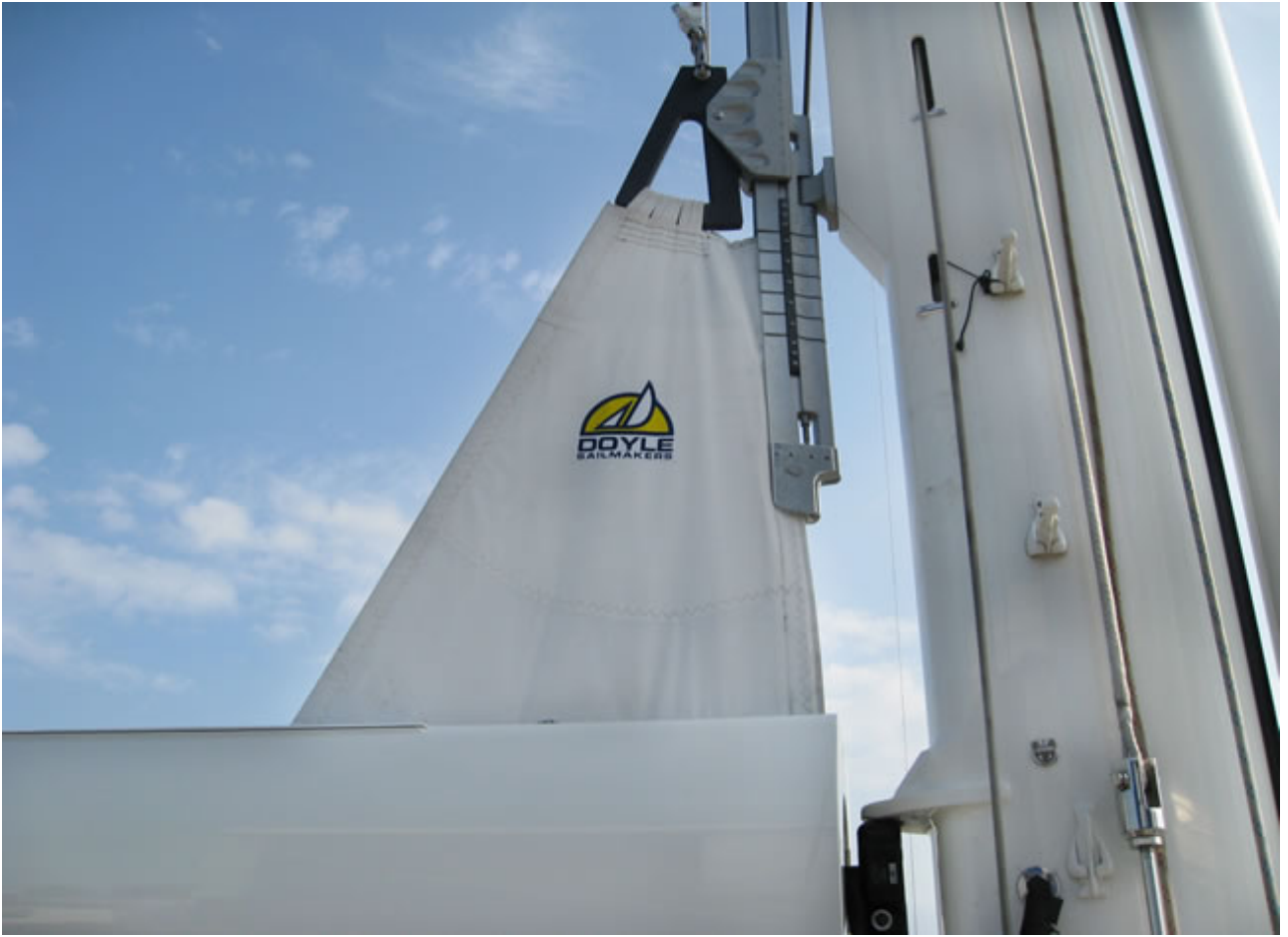
Prototype system previously tested on the 108' Shamoun