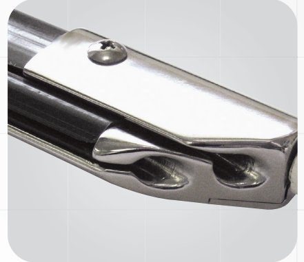
Twin grooves allow for easy sail changes

Stainless steel, snag-free feeder allows spinnaker sheets to pass freely