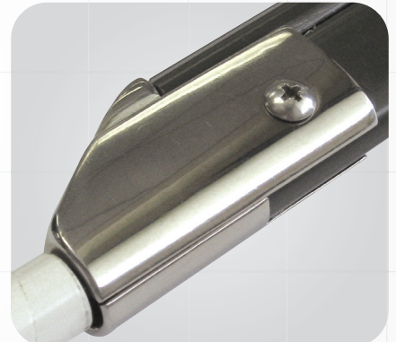
No snag, 2-piece S.S. captive feeder will not peel off